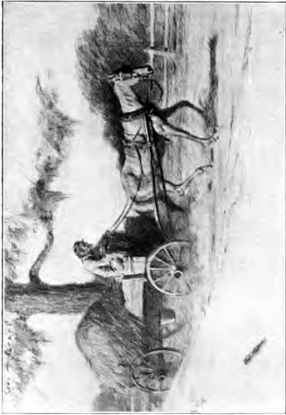
He drove an old-fashioned, flea-bitten blooded mare to a one-horse wagon full of forage